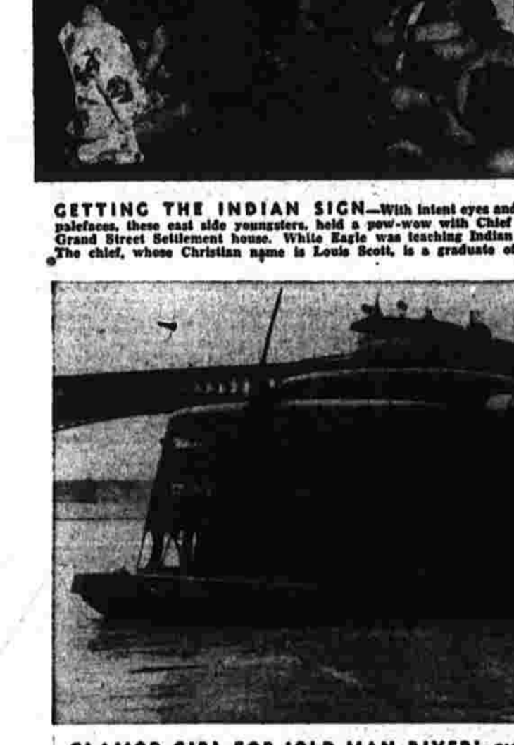
SO THOSE WHO FLY MAY SEE. —For the benefit of aviators, these American flags were spread on the five axel "air-liner" President Roosevelt, along with flags on the ship's side, when this vessel sailed from New York for Europe. The President Roosevelt was the first American boat to cross to Europe since war began between Germany and England, France.