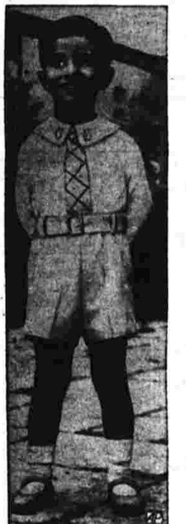
LITTLE KING. —What ever 4-year-old King Fetal II of Iraq for war, since he's too young to worry about European battles? He's having a holiday at Alay in Syria.